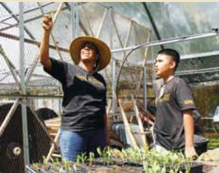
Kua O Ka La