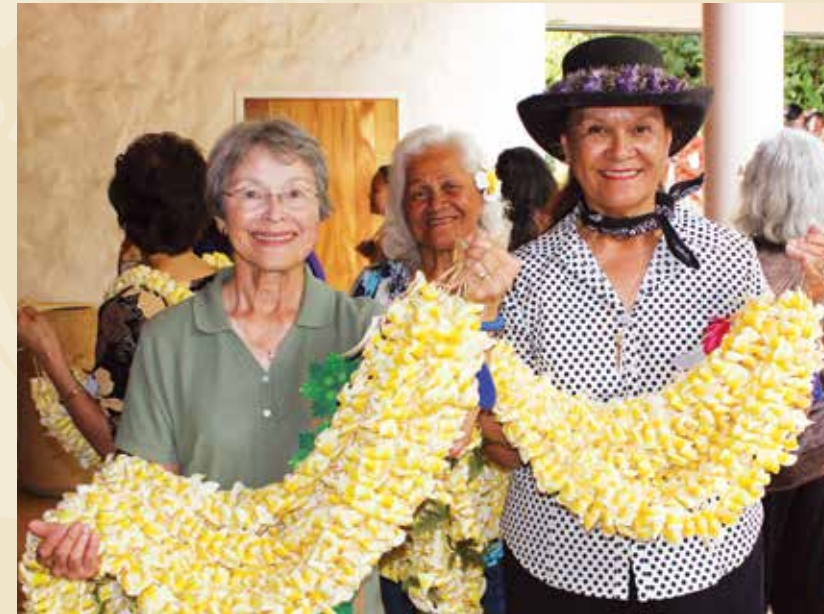
Class of 1942 show their appreciation for Princess Pauahi with ho'okupu