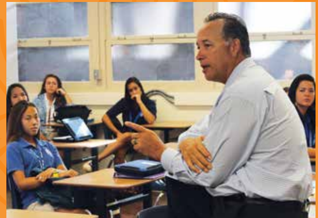
Top photo: 2012 Kamehameha Day Parade