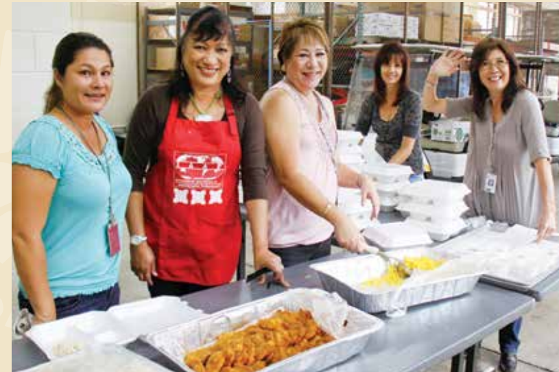
2012 Workplace Giving Fundraiser